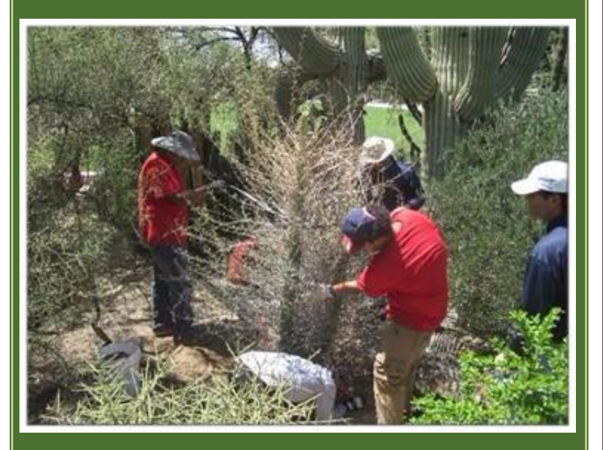
Plant of the Month The Boojum - Fouquieria columnaris